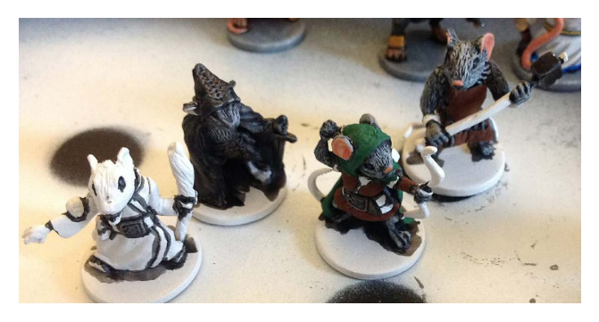
I like to paint the ears pink then paint the edges of the ear with flesh. I used the same technique on the tails and noses.

Here we see that Nez, Filch and Lily have their fur painted and dry brushed, and some color filling started.