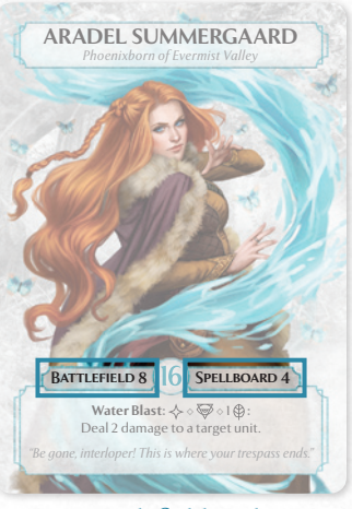
Battlefield and Spellboard values

You have a battlefield and a spellboard as part of your play area. Playing cards or activating card effects or abilities may cause cards to be placed on your battlefield or spellboard. As long as a card is on your battlefield or spellboard, it is considered under your control. There are a limited number of slots on your battlefield and spellboard, limiting the number of cards that can be